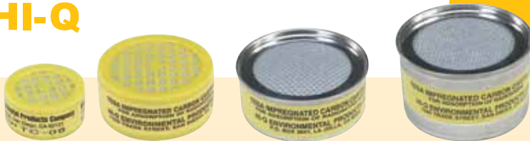
TC-08 TC-Series TCAL-Series TCGA-Series